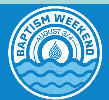
INFO MEETINGS HAPPENING AFTER SERVICE